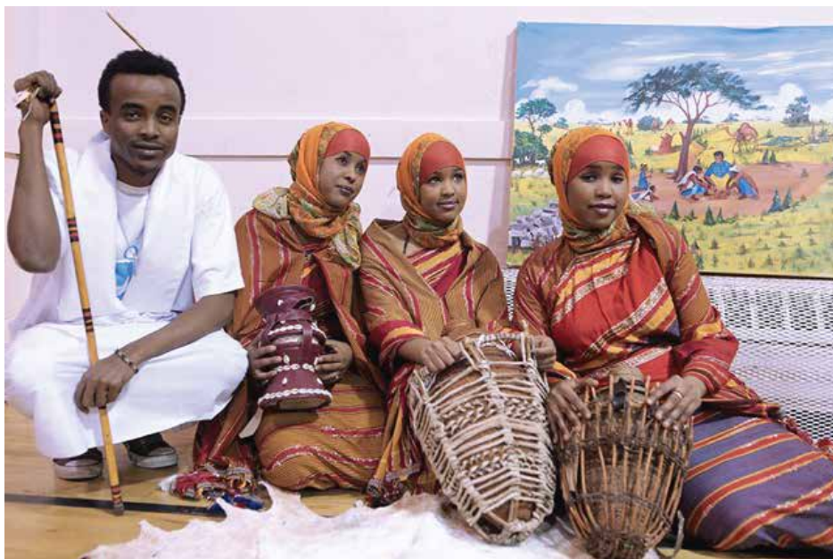
Young Somalis in traditional cultural clothing

The pursuit of these goals will inform diplomatic engagements. They will further guide the country as it pursues its vision of becoming peaceful, prosperous and globally competitive while promoting sustainable development.